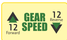
Wide Range of Speed