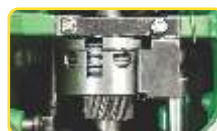
Electro-Hydraulic Wet Clutch