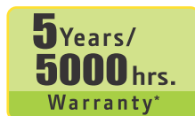
On Wet Clutch