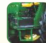
Side bar & steps with mat Climbing up and down the tractor is now easier