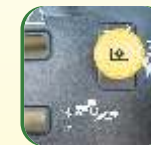
Electro-Hydraulic Operated PTO Switch